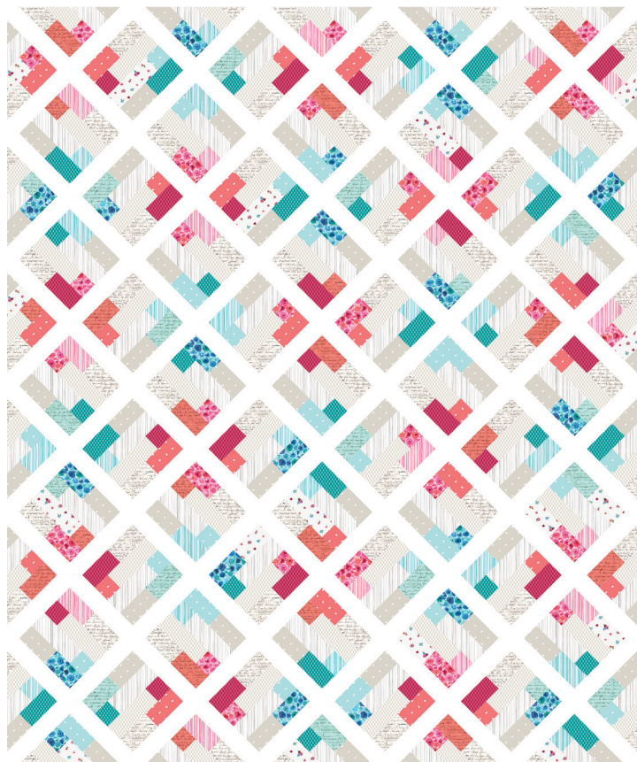
Two-Toned Quilt Assembly Diagram